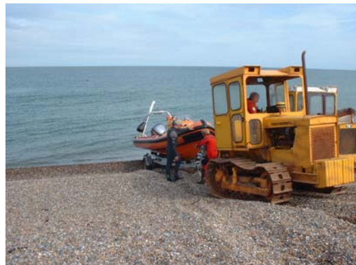
North Norfolk Dive Club launching the RIB "Norfolk Hero" from Weybourne beach.

Information on habitat type, marine life species and abundance together with sketches of dive sites are recorded on the seasearch observation forms. Copies of these have been sent to Seasearch at the Marine Conservation Society where results are fed into Marine Recorder, the database of the JNCC (Joint Nature Conservancy Council). Seasearch data including survey forms, photographs and specimens are collated, stored and used in educational material by Norfolk Seasearch.