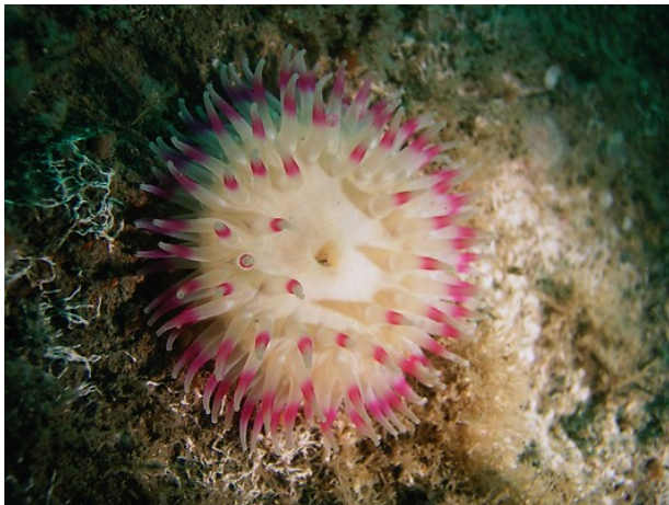
Dahlia anemone, HMS Umpire